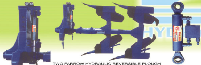
TWO FARROW HYDRAULIC REVERSIBLE PLOUGH