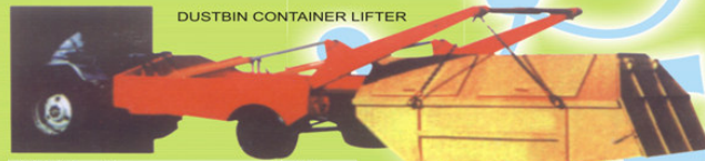
DUSTBIN CONTAINER LIFTER