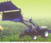
NEW HOLLAND OPENING BUCKET