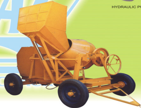
COMPLETE SET FOR MIXTURE MACHINE